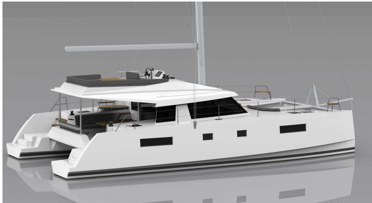
Non contractual image. Illustrations may feature optional equipment available at additional cost.

13,71 7,54 1,45 10 800 2 x 55 112 4 4 2 8+2+2 2 x 300 2 x 300