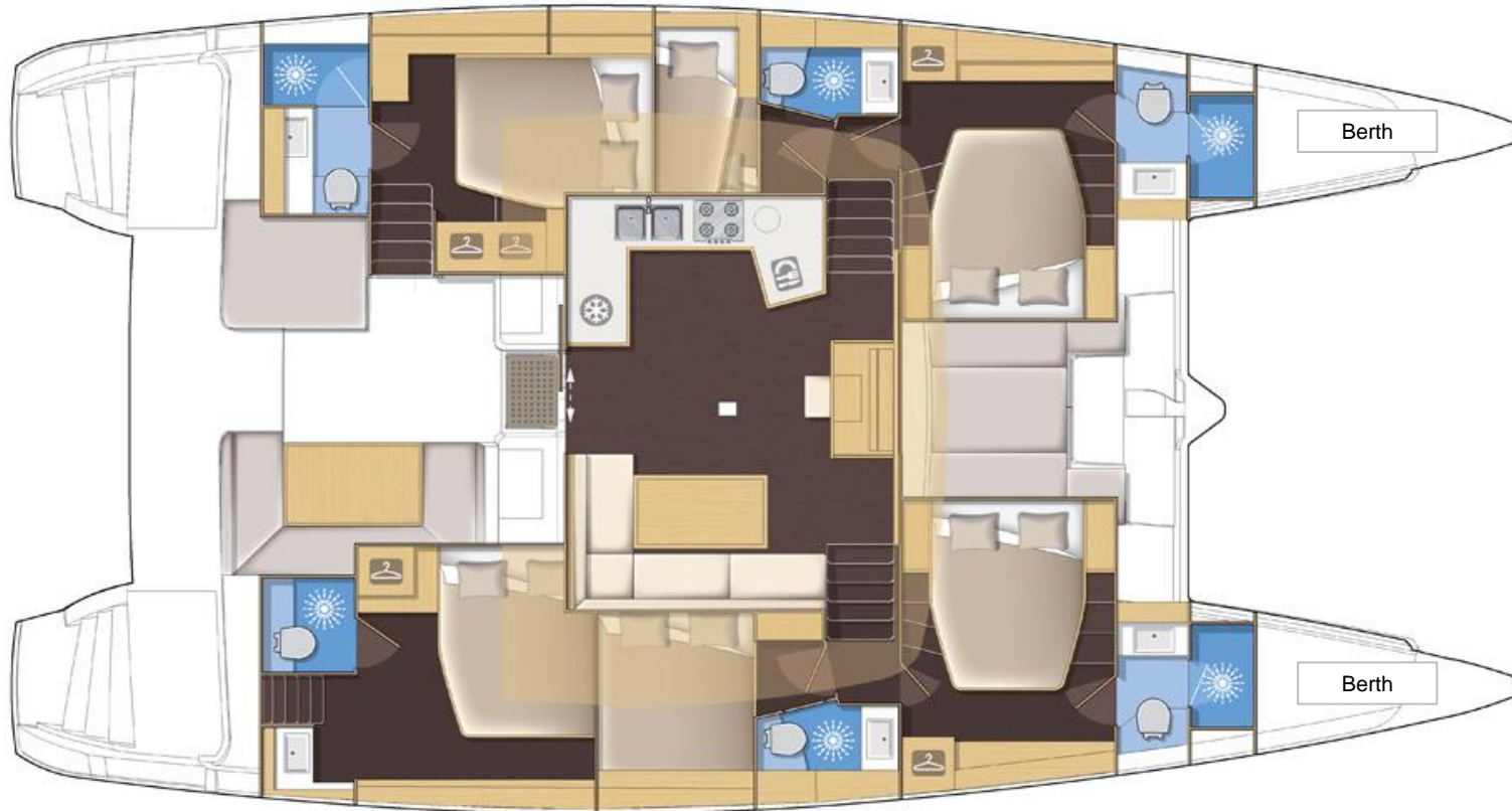
Non contractual image. Illustrations may feature optional equipment available at additional cost.