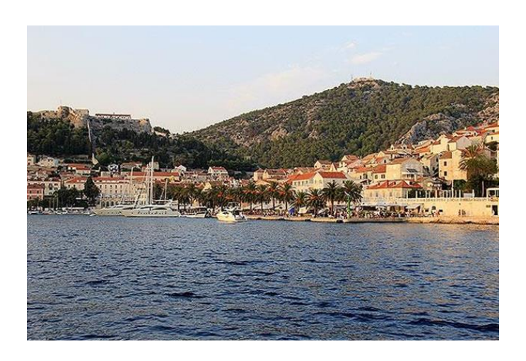
Day 7, Friday: Island of Hvar – Marina Seget Donji (Trogir) (25 NM)

(Hvar fortress). Apart from the charm this town has and its nightlife, you can find many secluded beaches and rocky coves on the island. Paklinski otovi (Hell Islands) nearby Hvar are recommended to spend the day at the beach.