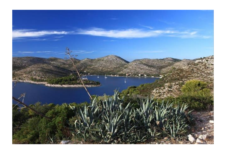
Day 5, Wednesday: Island of Lastovo – Vis (Island of Vis) (35 NM)

Island of Vis: Being a perfect blend of local lifestyle and tourist atmosphere, the Island of Vis will not disappoint you! You can enjoy the local architecture (Stiniva, St George's fortress) and gastronomy, as well as many other activities such as sports or summer events, and all that being situated in a beautiful nature and easy-going atmosphere. Vis is one among many great sailor spots. Close to the Island of Vis is located the Island of Biševo, which holds the Blue Cave ( Modra špilja ) that we certainly recommend visiting. Cove Stončica is the place ideal for swimming.