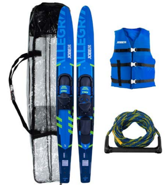
1X PACK SKIS COMBO ALLEGRE 67 JOB