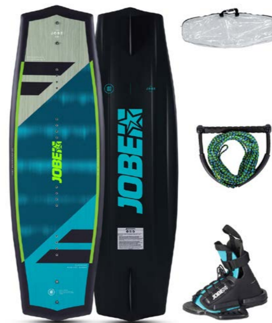
WAKEBOARD PACK FOR JUNIOR (33 TO 39 SIZE)