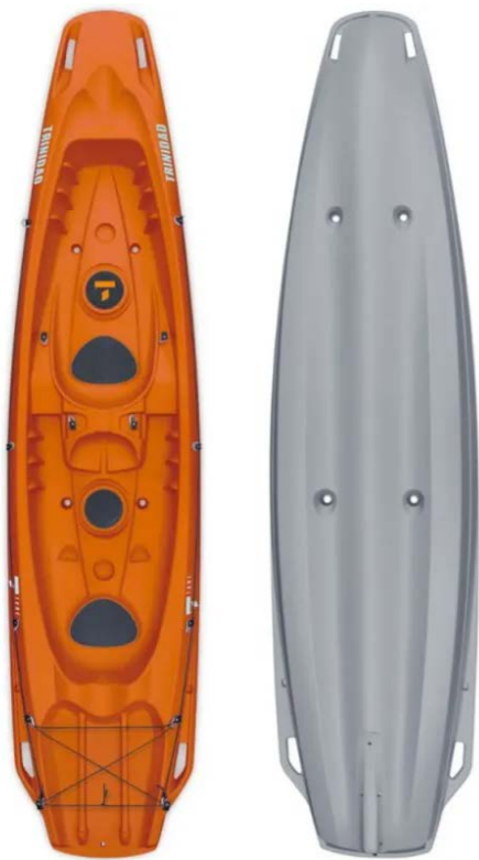
1X KAYAK TRINIDA