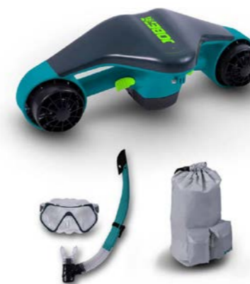
2X PACK SEASCOOTER INFINITY PRO